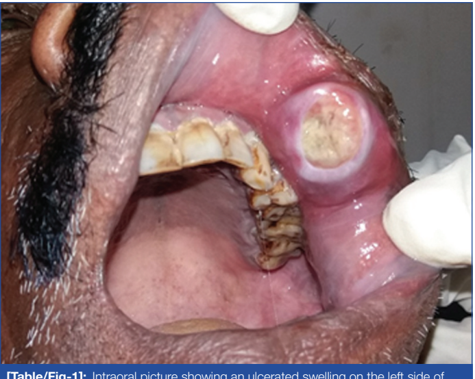
[Table/Fig-1]: Intraoral picture showing an ulcerated swelling on the left side of upper lip.

Keywords: Adenocarcinoma, Comedonecrosis, Minor salivary gland