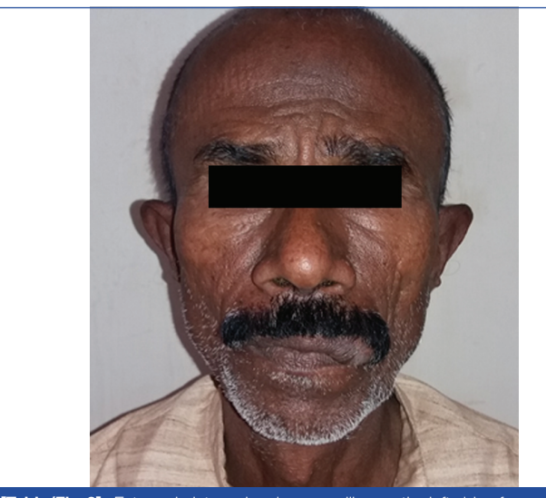
[Table/Fig-2]: Extraoral picture showing a swelling on the left side of upper lip.